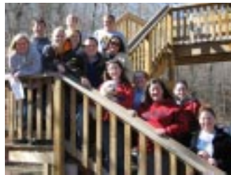
Pictured above are some of the young people who attended the Young Adult Winter Retreat that was held at Bethany Hills Camp in February.

News reports and information for publication in the Tennessee Christian should be addressed to 50 Vantage Way, Suite 251, Nashville, TN 37228